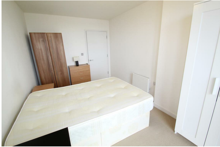
BEDROOM TWO VIEW