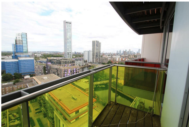
MAIN BEDROOM BALCONY