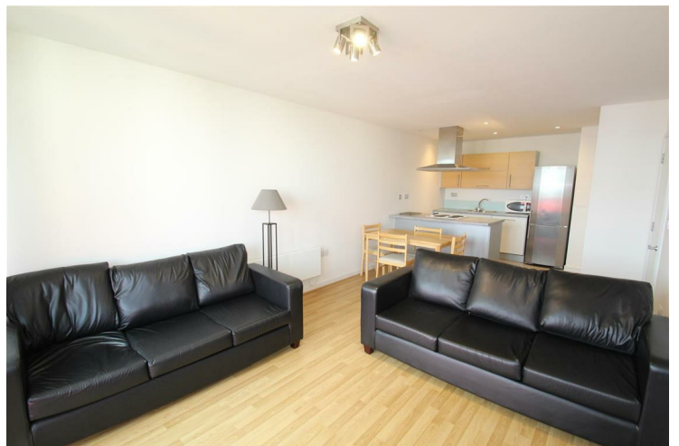
RECEPTION ROOM VIEW