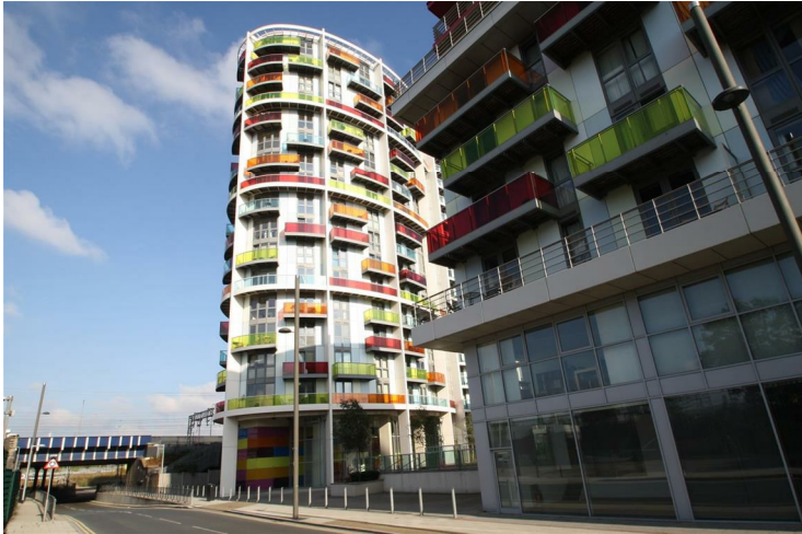
ICONA POINT DEVELOPMENT