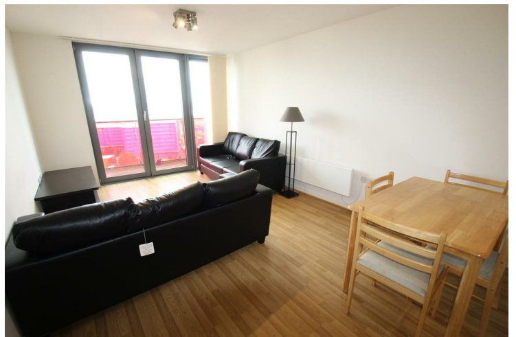
LIVING SPACE VIEW