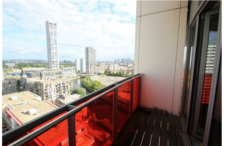
LIVING SPACE BALCONY