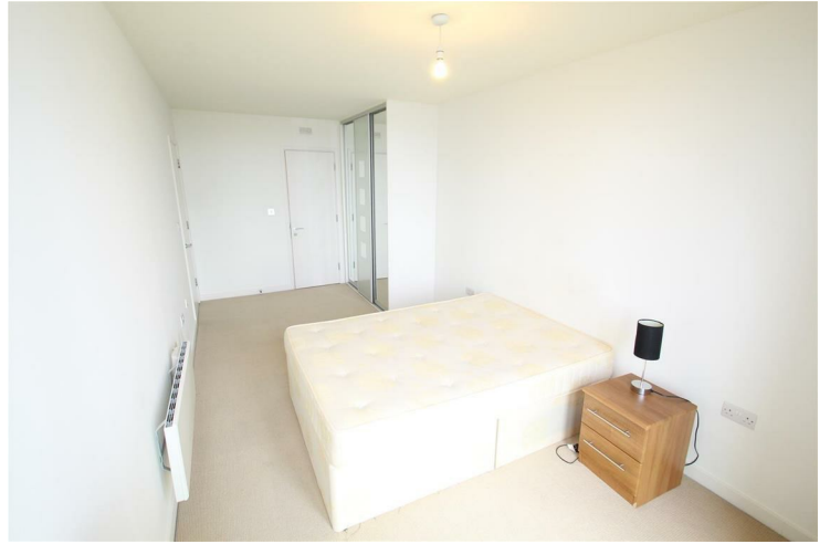
MAIN BEDROOM VIEW